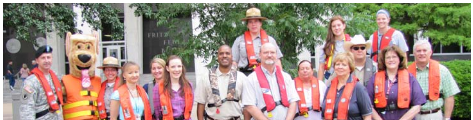
National Inflation Day photos submitted by Madeline Morgan.