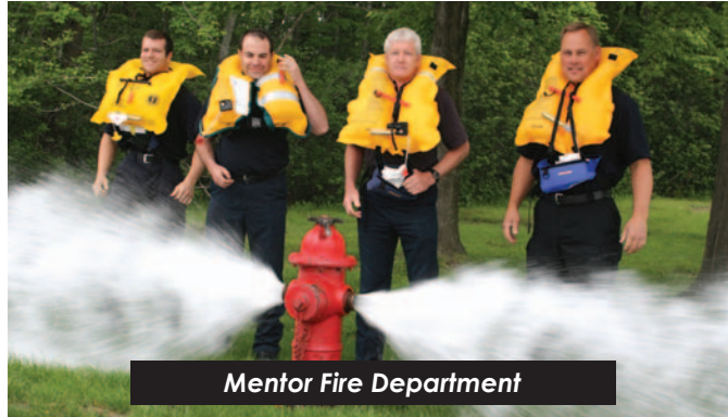
Mentor Fire Department

On Thursday, May 20 at 11 AM EDT people across the U.S.A. and Canada participated in a simultaneous deployment of inflatable life jackets. The goal was to heighten public awareness of boating safety issues, life jacket wear, and pre-launch National Safe Boating Week.