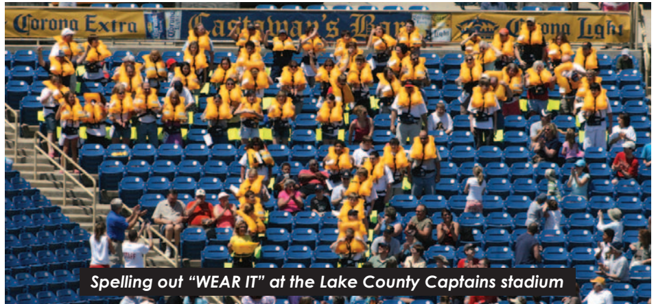
Spelling out "WEAR IT" at the Lake County Captains stadium

On Thursday, May 20 at 11 AM EDT people across the U.S.A. and Canada participated in a simultaneous deployment of inflatable life jackets. The goal was to heighten public awareness of boating safety issues, life jacket wear, and pre-launch National Safe Boating Week.