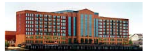
SAVANNAH MARRIOTT® RIVERFRONT

The International Boating and Water Safety Summit is the premier event for training, awareness, meeting and networking for anyone involved in boating and water safety. General sessions cover a broad spectrum of national as well as international concerns. The theme for this year's session will focus on the USCG National Strategic Plan and implementation opportunities. Breakout and hands-on sessions allow the individual to attend classes geared toward their profession. Registration forms and more information is available on the website: www.watersafetycongress.org See page 4 for a tentative schedule.