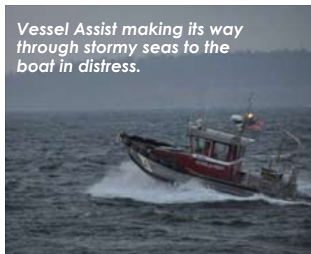
Vessel Assist making its way through stormy seas to the boat in distress.

the boat. They were smart to stay low, but my biggest concern was what none of them were wearing. A life jacket. I couldn't believe it! Even the children. The kids wore nothing but bathing suits and the two adults had t-shirts on.